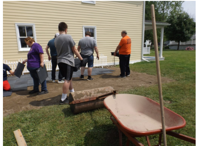
Transforming the area.