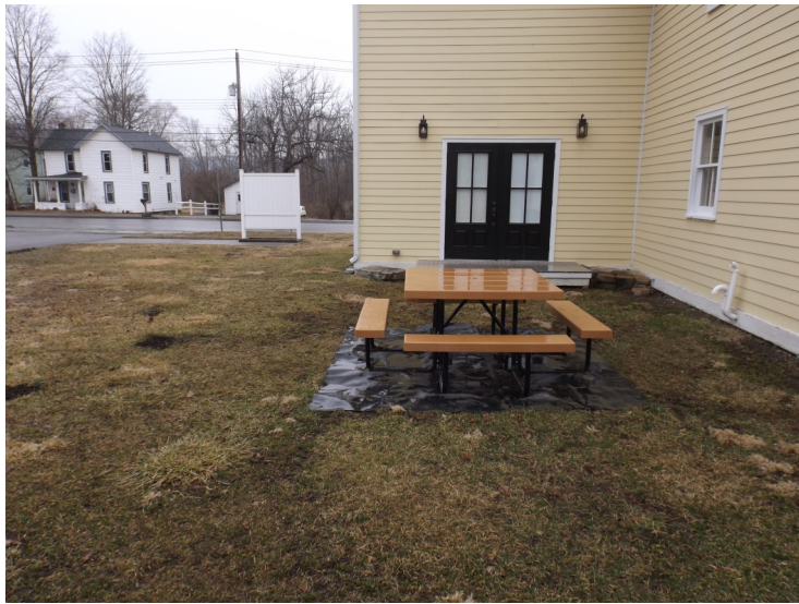
Before the Eagles Scout Project. Noah scopes out the work.